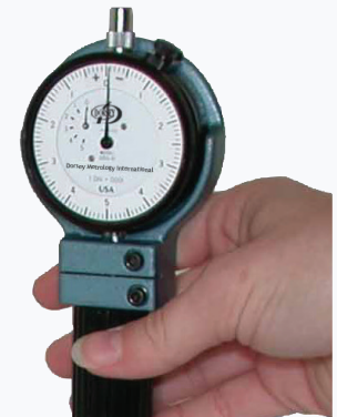
DBL-300 Shown being set with DBM- 1000 master